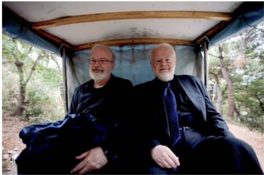
Jaunting through Turkey, Cardinal O'Malley and Metropolitan Methodios took a ride around the island of Halki during the joint Catholic-Orthodox pilgrimage in 2007.

One example of the Cardinal's fruitful ecumenical ministry is a 10-day pilgrimage to Rome, Constantinople, and St. Petersburg that he and I led in 2007.